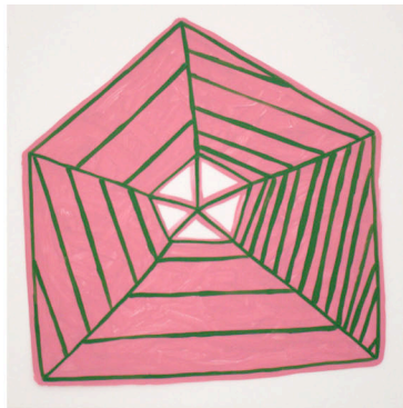
Pink , 2009 Acrylic on duralar, 11x11 inches