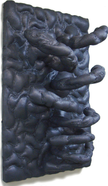
Cats Love It , 2009 Acrylic, felt & staples on panel 49 x 39 x 16 inches

Inspired by scientific illustration and popular design, Jones' paintings on paper are spontaneous yet iconic--playful emblems that seem to diagram arcane meanings and relationships. They are also a way of working, says the artist, that allows "mutations, hybrids, and synthetic forms to take shape."